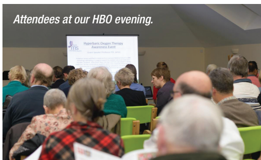
Attendees at our HBO evening.

Kent MS Therapy Centre is a lifeline to people living with the debilitating neurological condition multiple sclerosis, and your support is more vital than ever. Our running costs are now £300,000 each year, and whether you're a trust, foundation, company or individual fundraiser we want to say a huge thank you in helping us do what we do!